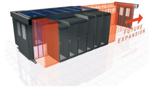
Flexibility to build a containment system and then add cabinets as needs dictate

Panduit's Net-Contain Universal Aisle Containment System allows users to reclaim underutilised cooling capacity and reduce energy and operational expenses by retrofitting their existing data centre with a versatile containment system. The system includes an independent support structure, sliding doors, vertical blanking panels and roof structure.