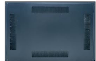
Brush cable entry

> FOR MORE DETAILS VISIT ANIXTER.COM/SHOPPANDUIT