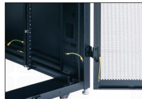
Bonded doors and side panels