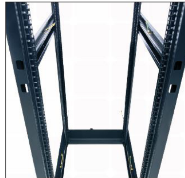
Fully adjustable equipment rails