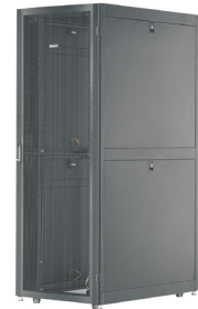
Net-Verse Cabinet System

Net-Verse Cabinets provide a 16-model offering matching most current IT applications including server, switch and network applications with flexible mounting options.