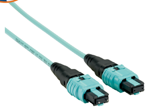
PanMPO™ gives the ability to change the polarity and gender of the connector in the field.

Panduit's PanMPO connector is the only MPO fibre optic connector available that can change polarity and gender in a matter of seconds, making your 10G to 40G Ethernet migration quick, easy and cost-effective. When it's time to migrate to 40G, you can switch the connectors to maintain standards compliance without replacing your fibre infrastructure.