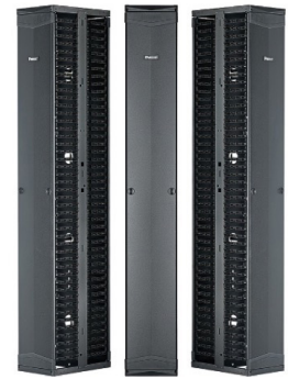
PatchRunner™ 2 Vertical Cable Managers

The vertical cable manager consists of a metal backbone with cable management fingers that align with EIA rack spacing. The fingers provide integral bend radius control throughout the entire length. The backbone has pass through holes for front-to-back cabling, with the option to blank off with a plug. The manager accepts a metal, hinged, push-to-close door that can open to the right or left. The door support brackets are integrated into the manager with no assembly required. The manager accepts plastic slack management spools that can be repositioned as required. The vertical panel manages all the cable on the rack without the aid of horizontal cable managers.