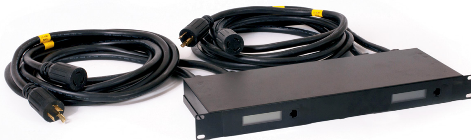
SmartZone™ Rack Energy Kit with 1RU inline meter

> FOR MORE DETAILS VISIT ANIXTER.COM/SHOPPANDUIT/EMEA