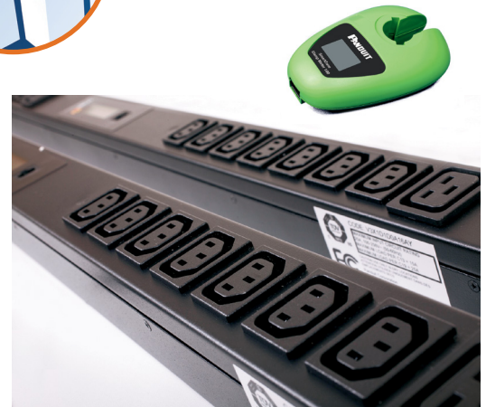
SmartZone™ rack PDUs and clamp meters are ideal for both green and brownfield applications.

Panduit’s SmartZone Rack Energy Kits are a DCIM solution specifically designed to provide cost-effective power and environmental monitoring for small data centres with 30 or fewer racks and cabinets. SmartZone™ Rack Energy Kits were designed as “out-of-the-box” offerings that are simple to order, install and use right away.