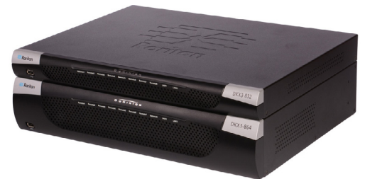
Multiple hardware models provide a flexible, scalable solution for all types of data centre requirements

Raritan's Dominion KX III is an enterprise-class, secure, KVM-over-IP switch that provides one, two, four or eight users with remote BIOS-level control of eight to 64 servers. It includes the features needed to eliminate trips to the data centre. Raritan's Universal Virtual Media lets administrators remotely perform tasks such as installing software, transferring files and backing up data. Customers can control and manage servers on the go via their Apple iPhones and iPads through Raritan's CommandCenter Secure Gateway.