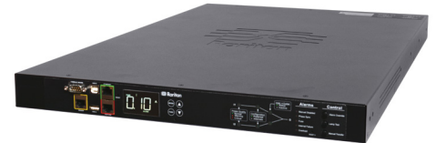
Hybrid rack transfer switch with outlet-level metering and switching

Raritan’s hybrid rack transfer switches use electromechanical relays and silicon controlled rectifiers (SCRs) to transfer a load between two sources. The result is performance and reliability that exceeds that of standard automatic transfer switches (ATS) at a lower price point than static transfer switches (STS).