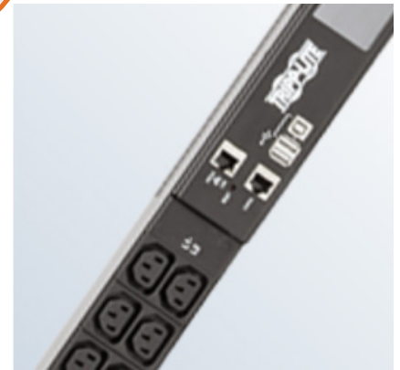
Built-In LX Platform Network Management Card allows remote access 24/7

Tripp Lite's newest 3-phase PDUs have a built-in LX Platform interface that is HTML5-based, so it does not require Java. The interface supports complete remote access for power monitoring and email notifications via a secure web browser, SNMP, telnet or SSH. The touchscreen LCD can also generate a unique QR code to allow read-only access to the PDU via a mobile device. When used with optional EnviroSense2 sensors, the LX Platform interface and touchscreen LCD can provide monitoring of temperature, humidity and dry contact connections.