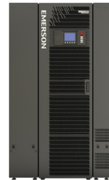
Liebert eXM UPS with battery and bypass cabinets

Through our strong global partnerships and alliances with manufacturers such as Vertiv, we are able to present you with the following offering to meet your specific data center requirements.