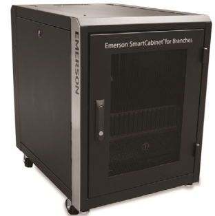
SmartCabinet IT infrastructure solution

Vertiv's SmartCabinet is a new approach to providing a complete IT infrastructure solution that contains power, an enclosure, power distribution, monitoring and infrastructure management all in a simple packaged solution. It is a fully integrated, industry-leading plug-and-play solution with a ready-to-use IT rack space. It eliminates the need to build complex computer rooms, which dramatically improves the speed of system deployment compared to the traditional approach. Preconfigured, preinstalled and factory tested to ensure system compatibility, SmartCabinet is ready to use from day one.