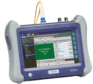
All-in-one handheld network tester that technicians need to install, turn-up and maintain their networks.

Viavi's T-BERD/MTS-5800 handheld network tester is the one tool that network technicians and engineers need to install, turn-up and maintain their networks. The industry's smallest handheld instrument can test throughout the service life cycle, including fiber characterization, service activation, troubleshooting and maintenance.