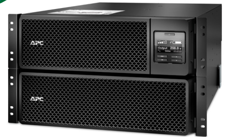
Smart-UPS with additional battery pack.

APC by Schneider Electric's Smart-UPS On-Line provides high-density, double-conversion online power protection for servers, voice/data networks, medical labs and light industrial applications. The Smart-UPS On-Line is capable of supporting loads from 5 kVA to 10 kVA in a rack/tower convertible chassis. When business-critical systems require runtime in hours, not minutes, Smart-UPS On-Line can be configured with multiple battery packs to meet aggressive runtime demands.