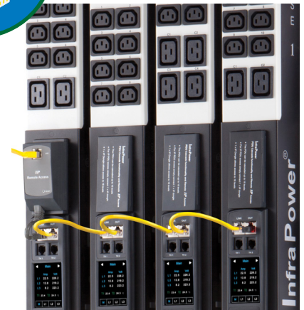
W series PDUs are designed to support daisy chain configurations.

InfraPower locally metered, remotely monitored and switched rack PDUs are designed for use across the network, either locally via SNMP or over IP.