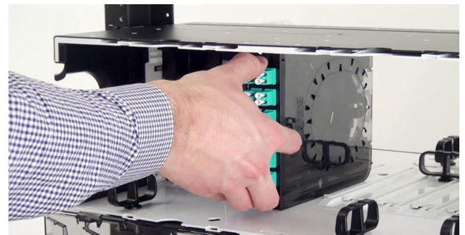
Provides maximum installer flexibility for frequent MAC work.

> FOR MORE DETAILS VISIT ANIXTER.COM/SHOPBELDEN