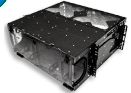
Reduce space and costs with Belden's ECX-04U.