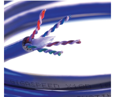
GigaSPEED X10D cable provides 10G Ethernet performance.

CommScope's SYSTIMAX GigaSPEED X10D Solution provides 10G Ethernet performance for improved bandwidth, data throughput and network efficiency. The cable features a reduced diameter that optimizes transmission performance, which gives network managers increased rack space and airflow without introducing alien crosstalk. Easy to install and backward compatible with 1G switches, GigaSPEED X10D provides the additional bandwidth customers need for future applications including IEEE 802.3ac Wi-Fi.