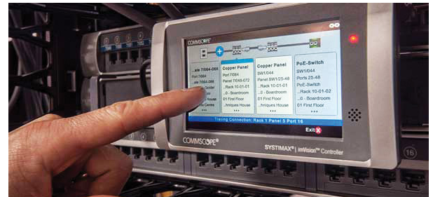
imVision controller showing circuit trace