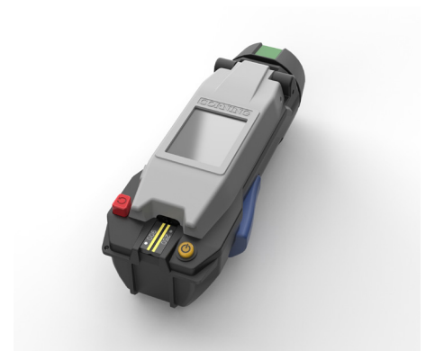
UniCam High-Performance Connector Installation Tool with integrated CTS (continuity test set)

> FOR MORE DETAILS VISIT ANIXTER.COM/SHOPCORNING/APAC