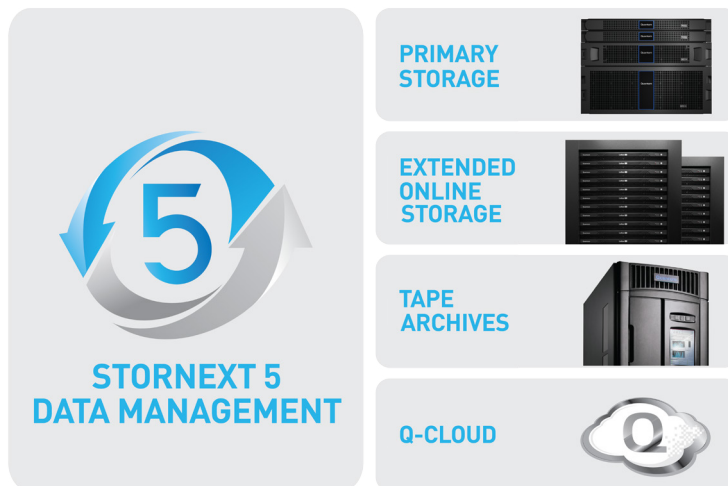
Building blocks of the StorNext architecture

> FOR MORE DETAILS VISIT ANIXTER.COM/SHOPQUANTUM/APAC