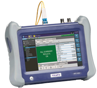
All-in-one handheld network tester.

Viavi's T-BERD/MTS-5800 handheld network tester is the one tool that network technicians and engineers need to install, turn-up and maintain their networks. The industry's smallest handheld instrument can test throughout the service life cycle, including fiber characterization, service activation, troubleshooting and maintenance.