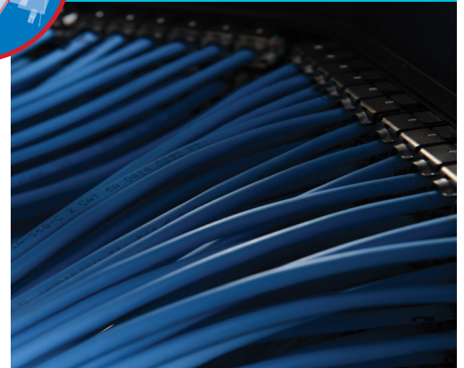
Smaller diameter cables improve density.

Berk-Tek's LANmark-XTP features a diameter of 0.27 in., allowing easier, more efficient installation and cable management. The smaller size also improves density and cooling. It features innovative noise-canceling XTP technology that delivers exceptional alien crosstalk (AXT) and mission critical systems performance. LANmark-XTP is capable of transmitting 10GBASE-T network applications running at 10 Gigabit speeds with performance verified beyond ANSI/TIA Category 6A standards by third-party labs.