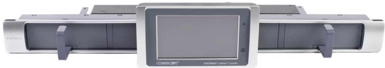
Web- Enabled Dashboard for Ease of Monitoring

> FOR MORE DETAILS VISIT ANIXTER.COM/SHOPCOMMSCOPE