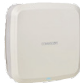
ION-E universal access point

CommScope's ION-E Series flattens the infrastructure onto a single physical layer while simplifying the design, deployment and operations of the wireless system. The unified wireless infrastructure helps operators maximise the use of existing and future IT cabling infrastructure. ION-E transports capacity to wherever it's needed in real time by using a software-defined switch and distribution method. The system's simplicity helps operators meet their current challenges while positioning them for long-term success—no matter if it is for inpatient services, outpatient services or in the data centre.