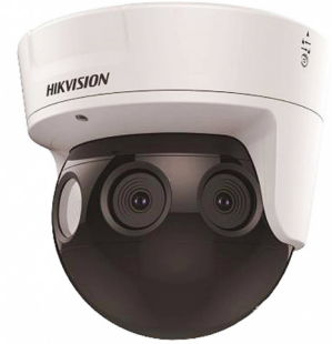
Hikvision's PanoVu Network Dome Cameras offer 4096x1800 resolution at 30 fps in panorama mode.

Hikvision's DS-2CD6924F-IS PanoVu Outdoor Network Dome Camera Series offers a full 180-degree view stitched together from four 2 MP cameras. Features include four 4 mm lenses with 1/2.8" progressive scan CMOS sensors for a total of 4096x1800 resolution at 30 fps.