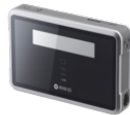
USB iCAMTD100 and iCAM7000S-(B or T) B = Black T = Titanium/Silver