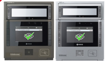
Iris ID iCAM7S readers with built-in card reader and LCD touchscreen.

The IP-based iCAM models have been deployed globally across many of the world's leading companies throughout data centers, hospitals, airports and anywhere that a proven biometric solution is required. The IrisAccess solution has been deployed for more than 15 years.