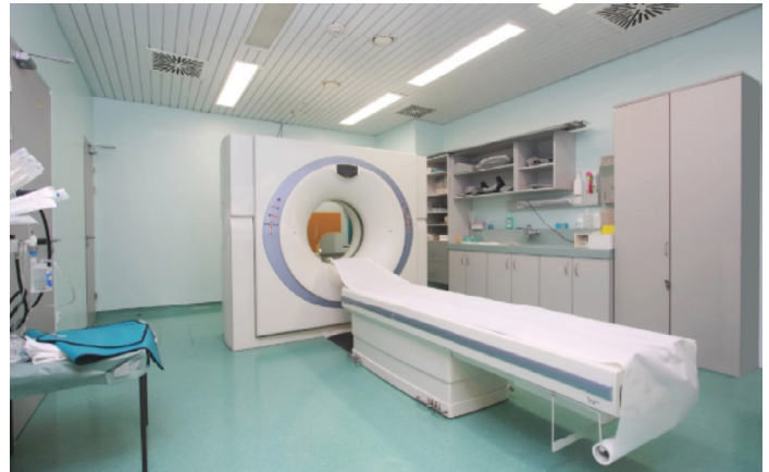
Itray is the ideal solution for a non-ferrous MRI room.

> FOR MORE DETAILS VISIT ANIXTER.COM/SHOPLEGRAND