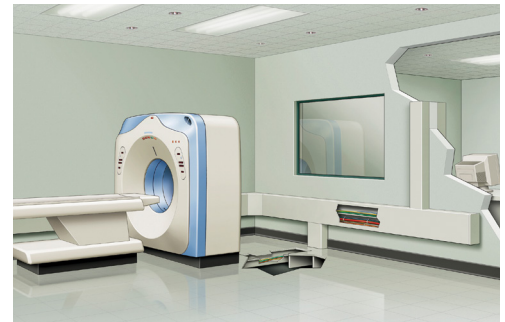
Aluminum Wallduct installed in an MRI room

> FOR MORE DETAILS VISIT ANIXTER.COM/SHOPLEGRAND