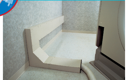
Wallduct steel or aluminum raceway with lay-in features for enclosure of wire and cable

Legrand's Wallduct Medical Raceway System is a high-capacity raceway for use in walls or ceilings. It can be mounted to the wall's surface or flush with the wall to meet equipment layout and room designs. The lay-in feature for enclosure of wire and cable is ideal for use in healthcare rooms, under raised floors or as a large capacity feeder for perimeter raceway. The cover plates are easily removed for wire and cable access.