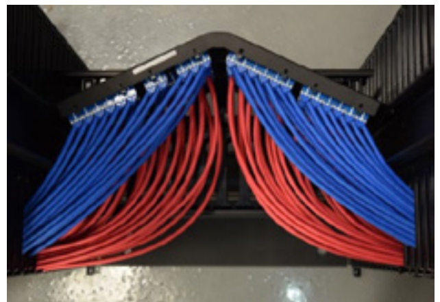
Left/right terminations on the back side of an angled patch panel help direct cabling to the sides of the rack and help manage cable bulk.

> FOR MORE DETAILS VISIT ANIXTER.COM/SHOPPANDUIT/APAC