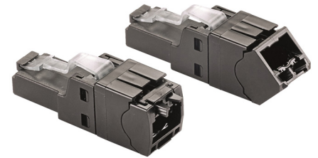
The simple-to-attach TX6A Field Term Plug, available in both straight and angled versions, use Panduit's familiar TG-style termination to optimize performance.

The TX6A Category 6A UTP Field Term RJ45 Plug is a simple-to-attach plug for field termination of 4-pair unshielded twisted-pair cable. Providing Category 6A performance, the TX6A™ plug is also compatible with Category 6 and 5e systems. The two-piece straight and up/down angled TX6A(TM) plug terminates 4-pair, 22-26 AWG, 100 ohm unshielded twisted-pair cable and uses proven TG-style forward motion termination technology to optimize performance by maintaining cable pair geometry while eliminating conductor untwist.