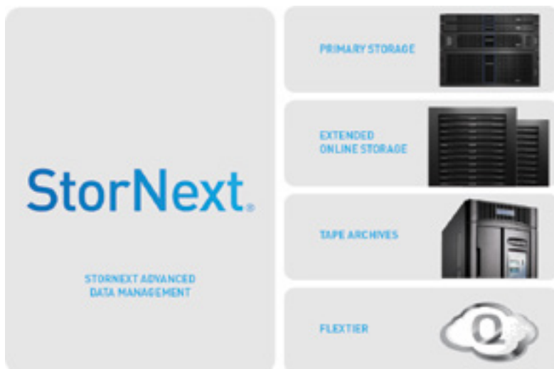
Building blocks of the StorNext architecture

> FOR MORE DETAILS VISIT ANIXTER.COM/SHOPQUANTUM/APAC