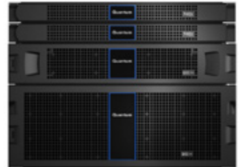
StorNext powers high-performance shared storage for collaborative workflows.