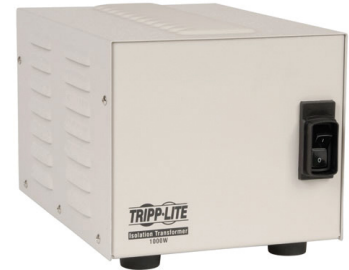
IS1000HG isolation transformer includes four NEMA5-15R hospital grade output receptacles.

Tripp Lite's UL60601-1 listed medical-grade isolation transformers offer line isolation, continuous noise filtering and enhanced common-mode surge suppression. An internal low-impedance isolation transformer component offers 100 percent isolation from the input AC line. Full UL60601-1 medical-grade listing with hospital-grade plug and outlet receptacles makes Isolator medical-grade transformers ideal for protection of medical electronic equipment in patient-care areas. These transformers are ideal for equipment that does not require battery backup but does require reduced leakage current and medical-grade regulatory compliance.