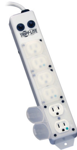
PS-615-HG-OEM power strips

> FOR MORE DETAILS VISIT ANIXTER.COM/SHOPTRIPLITE