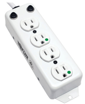
PS-415-HG-OEM power strips

Through our strong global partnerships and alliances with manufacturers such as Tripp Lite, we are able to present you with the following offering to meet your specific healthcare requirements.