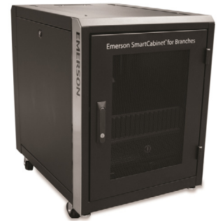
SmartCabinet IT infrastructure solution

Vertiv's SmartCabinet is a new approach to providing a complete IT infrastructure solution that contains power, an enclosure, power distribution, monitoring and infrastructure management all in a simple packaged solution. It is a fully integrated, industry-leading plug-and-play solution with a ready-to-use IT rack space. It eliminates the need to build complex computer rooms, which dramatically improves the speed of system deployment compared to the traditional approach. SmartCabinet is preconfigured, preinstalled and factory tested to ensure system compatibility and is ready to use from day one.