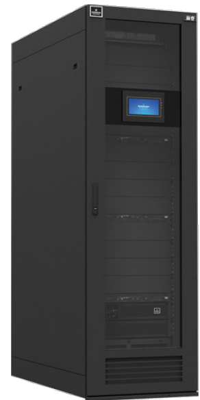
SmartCabinet is an intelligent, integrated infrastructure solution in an enclosure.

> FOR MORE DETAILS VISIT ANIXTER.COM/SHOPVERTIV