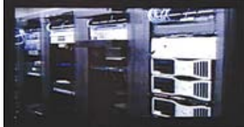
Using category 6A cabling