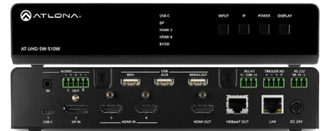
Universal Switcher With Wireless Link

The Atlona AT-UHD-SW-510W is a 5x2, multi-format matrix switcher with wireless presentation capability. It provides universal BYOD (bring your own device) compatibility with HDMI, DisplayPort, and USB-C inputs, plus wireless connectivity for mobile devices. The SW-510W is HDCP 2.2 compliant, and features matrixed or mirrored HDMI and HDBaseT outputs. It also includes automatic input switching and automatic display control capability, both applicable to wired and wireless source connections. This unique multi-format matrix switcher and wireless gateway provides a universal connectivity solution for presentation devices in a wide range of professional A/V applications.