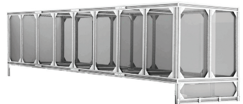
BTS Kit arrives on a pallet and includes eight unique components designed for easy installation and customization onsite.