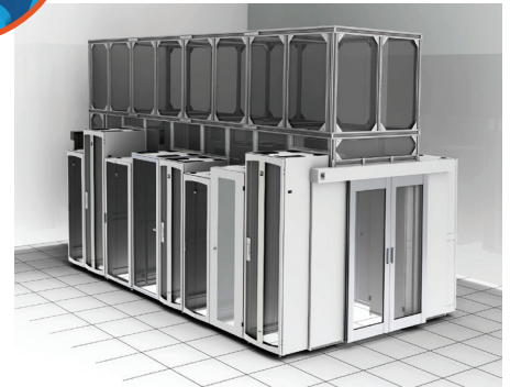
The BTS kit is ideal for retrofit applications over a mix of cabinets, including cabinets of varying heights, widths and depths.

With built-in flexibility and high-quality engineering, the BTS Kit Aisle Containment Solution easily adapts to challenges such as limited ceiling height and complex overhead pathways, making this solution an excellent choice for both brownfield and greenfield data center applications.