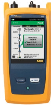
Graphical EventMap™ view - PASS

The OptiFiber Pro not only makes fiber deployment in data centers possible, but also provides the highest level of accuracy for quick problem resolution. With its simple Taptive™ user interface and powerful feature set, the OptiFiber Pro turns anyone into an efficient and expert premise fiber troubleshooter or installer.