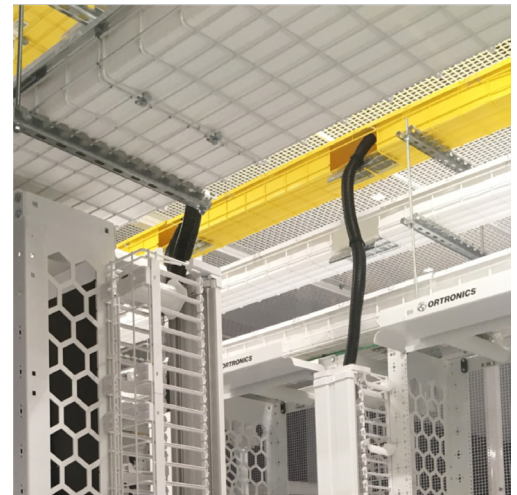
Cablofil® Wire Mesh

> FOR MORE DETAILS VISIT ANIXTER.COM/SHOPLEGRAND