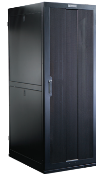
Available in 29 different frame sizes and two colors (black or white).

Legrand Mighty Mo GX leverages the best practices of infrastructure design, providing the proper support and protection needed for network equipment. The Mighty Mo GX cabinet is fully modular and configurable to suit the needs of your specific installation. Each cabinet can be assembled with as few or as many accessories as needed to properly support your servers, switches and patch panels. The cabinets are designed to stand alone or easily gang together as your network demands increase.