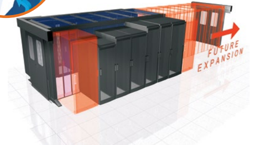
Flexibility to build a containment system and then add cabinets as needs dictate

Panduit's Net-Contain Universal Aisle Containment System allows users to reclaim underutilized cooling capacity and reduce energy and operational expenses by retrofitting their existing data center with a versatile containment system. The system includes an independent support structure, sliding doors, vertical blanking panels and roof structure.