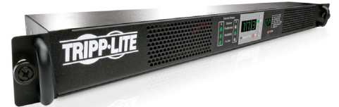
Field-proven performance, reliability and efficiency for data center applications

Tripp Lite's breakthrough, patent-pending, three-phase rack ATS provides rapid coordination of unsynchronized phases without dropping loads and operates with the high efficiency and reliability required for data center applications. With three-phase rack ATS solutions up to 17.3 kW, it's possible to eliminate dozens of costly redundant power supplies per server rack, which typically allows the remaining power supplies to operate with higher efficiency. Combining reduced hardware requirements with a reduction in power and cooling costs, a Tripp Lite three-phase rack ATS can save thousands of dollars per server rack.