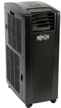
SRCOOL12K self-contained air conditioning unit

Tripp Lite's SRCOOL12K SmartRack Portable Air Conditioning Unit pumps 12,000 BTU of cooling power into an IT environment to prevent shutdowns, malfunctions and failures caused by overheating or fluctuating temperatures. Part of the SRCOOL® line, the compact, portable SRCOOL12K unit is perfect for micro data centers and other IT environments with heat-sensitive equipment in areas that facility air conditioning cannot reach.