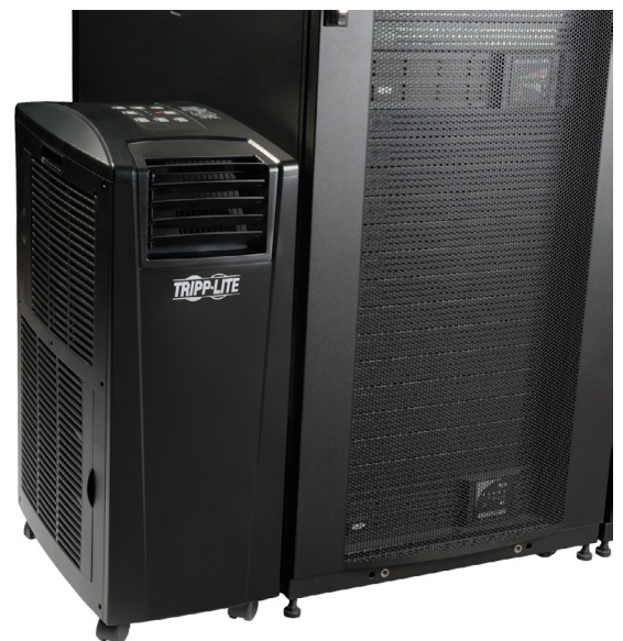
SRCool12K unit can be configured with a standard louvered vent for general room cooling.

> FOR MORE DETAILS VISIT ANIXTER.COM/SHOPTRIPPLITE