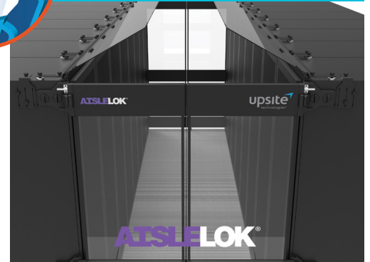
The industry's first containment solution designed for quick and easy installation on individual racks.

AisleLok Modular Containment offers the same core airflow management benefits of traditional containment solutions, but with the major advantage of saving time and money up front. And with no third party required for design or installation, it's affordable enough to deploy over multiple aisles or rooms.