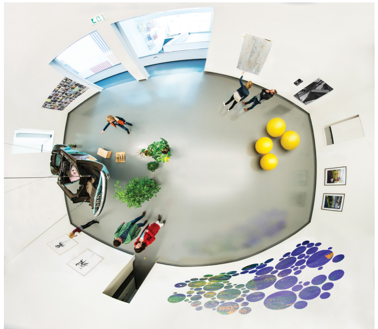
Panoramic birds-eye-view with FLEXIDOME camera

➤ FOR MORE DETAILS VISIT ANIXTER.COM/SHOPBOSCH