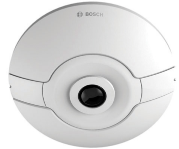
FLEXIDOME IP Panoramic 7000 MP

Bosch's FLEXIDOME IP Panoramic 7000 MP camera is a discreet low-profile camera for indoor use. The 12 MP sensor operating at 30 FPS provides full panoramic surveillance with complete area coverage, fine details and high speeds. The camera offers full situational awareness and simultaneous E-PTZ views in high resolution.