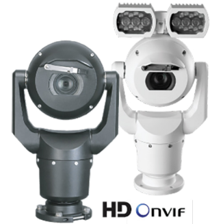
MIC IP Starlight 7000 HD

Bosch's MIC IP Starlight 7000 HD cameras are built upon an advanced pan/tilt/zoom (PTZ) platform that complies with tough industry standards such as IP68, NEMA 6P and IK10 for extreme mechanical strength and durability. By using the latest technology in intelligent coding and Content-Based Imaging Technology (CBIT), the HD module delivers high-resolution video streaming even under challenging low-light conditions.