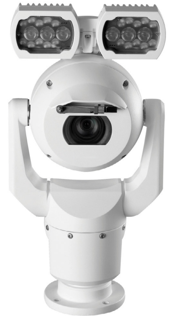
MIC IP Starlight 7000 HD with illuminators

➤ FOR MORE DETAILS VISIT ANIXTER.COM/SHOPBOSCH