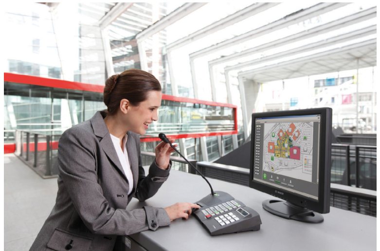
Call stations are ideal for medium- and large-scale public address and voice alarm applications.

> FOR MORE DETAILS VISIT ANIXTER.COM/SHOPBOSCH