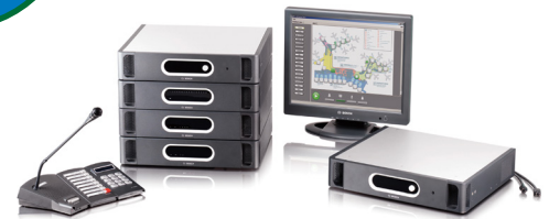
Praesideo public address and emergency sound system

Bosch's Praesideo is a complete, full featured digital public address and emergency sound system. It leads the market in reliability, especially in voice evacuation, and it has demonstrated years of performance in a wide range of applications. With more than 6,000 installed systems worldwide, it is the number one solution for demanding public address and emergency sound applications.