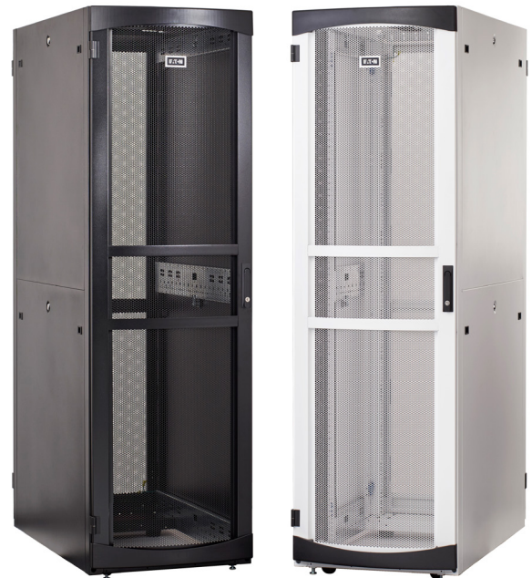
RS supports tool-less configuration of all key enclosure components, reducing installation time.