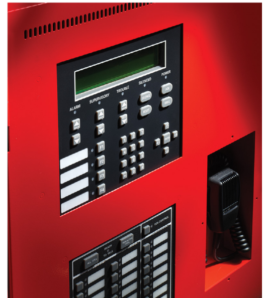
6820EVS Function Keys and Call Buttons

> FOR MORE DETAILS VISIT ANIXTER.COM/SHOPHONEYWELL