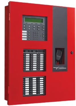
Silent Knight 6820EVS