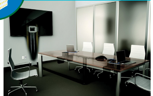
Legrand's InteGreat Series is adaptable to most meeting room tables.

Legrand's InteGreat Series, part of Wiremold® Meeting Room Solutions, offers an innovative way to better manage technology in meeting rooms by bringing power, communications and A/V from the building infrastructure to the point of use with products that are designed to seamlessly fit together. InteGreat products are easy to install and organize and provide protection for cords and cables while offering easy access for future technology upgrades.