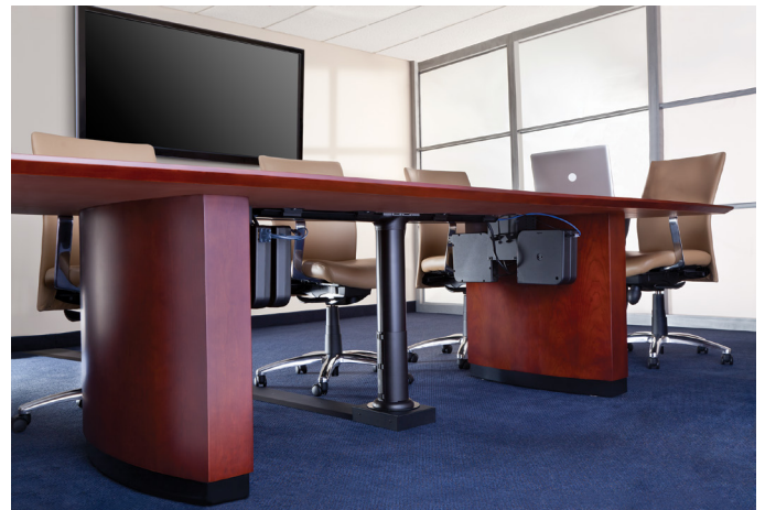
Legrand's InteGreat Series ensures cable organization and protection from the point of use to the building infrastructure.

> FOR MORE DETAILS VISIT ANIXTER.COM/SHOPLEGRAND