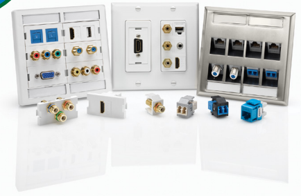
A/V solution multimedia outlets

Leviton's IT/AV System delivers high-quality video enterprise-grade plug-and-play systems by extending signals over HDBaseT™ certified links without requiring any programming. The low-profile system is adaptable and can handle future multimedia devices. The easy-to-install, standards-based solution requires little to no training, which enables low-voltage, BICSI RCDD contractors to be the A/V experts for their customers.