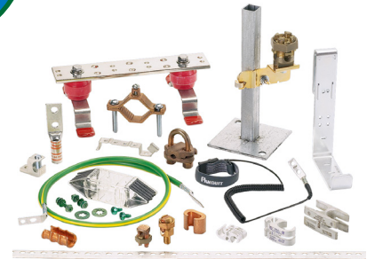
The Panduit StructuredGround grounding systems

Panduit's StructuredGround grounding system offers end-to-end solutions for your critical application requirements and provides a high-quality, visually verifiable and dedicated grounding path to maintain system performance, improve network reliability as well as protect network equipment and personnel. The system is compliant with UL 467 grounding requirements to ensure long-term reliability and safety.