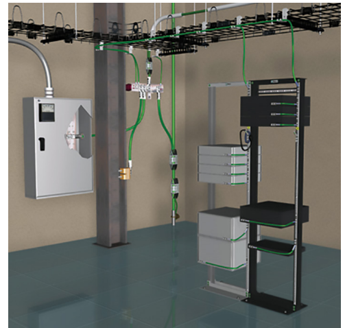
Panduit offers integrated power and grounding solutions.

> FOR MORE DETAILS VISIT ANIXTER.COM/SHOPPANDUIT