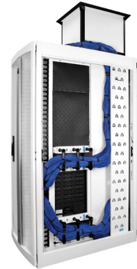
Complete airflow isolation for high-density network and storage switches